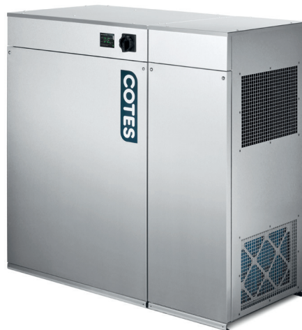
C35 DEHUMIDIFIER WITH HEAT RECOVERY MODULE