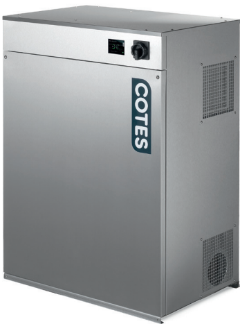
C35 DEHUMIDIFIER (model shown with PLC)