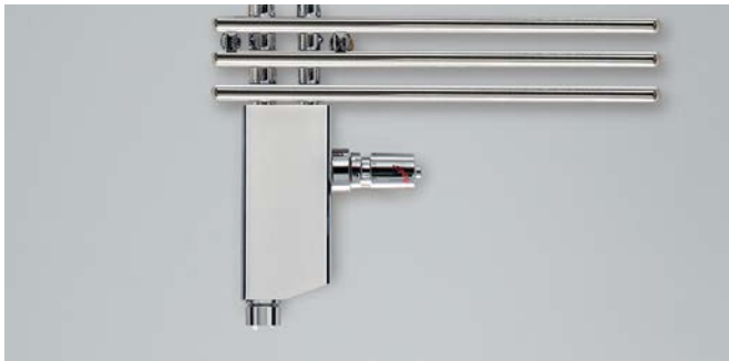
Connection fittings with cover in chrome for dual energy operation version.