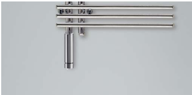
Electric operation version with integrated electric heating element WIVAR BASIC RF.