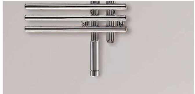
Electric operation version with integrated electric heating element WIVAR BASIC RF.

V20180815, RAD_DAS, SL_en, subject to change without notice